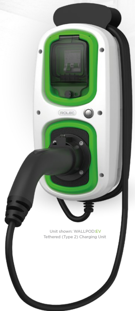
Unit shown: WALLPOD:EV Tethered (Type 2) Charging Unit

The WALLPOD:EV is a low-cost, entry level charging unit, designed to offer full Mode 3 fast charging to every Electric Vehicle (EV/PHEV) on the market today.