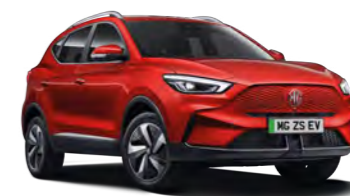
DYNAMIC RED TRI-COAT PAINT*

*Tri-coat and metallic paint optional at extra cost.