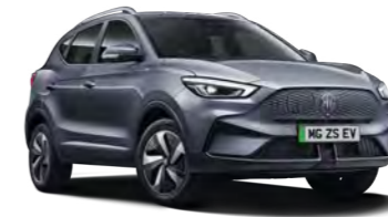
MONUMENT SILVER METALLIC PAINT*