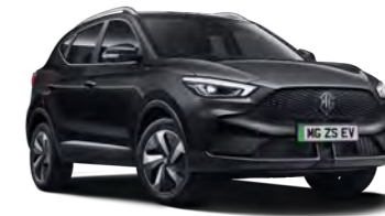
BLACK PEARL METALLIC PAINT*