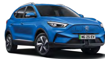
BATTERSEA BLUE METALLIC PAINT*