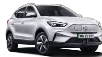
ARCTIC WHITE STANDARD PAINT