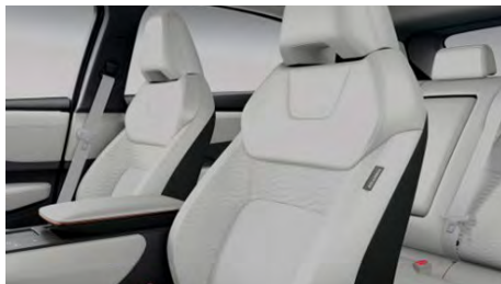
Option on ADVANCE and e-4ORCE ADVANCE: Grey - Synthetic Leather with Fabric inserts