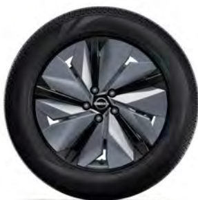
ADVANCE, EVOLVE, E-4ORCE ADVANCE AND E-4ORCE EVOLVE 19" ALLOY WHEEL WITH AERO COVER