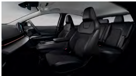
ADVANCE and e-4ORCE ADVANCE: Black - Synthetic Leather with Fabric inserts