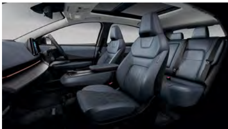
Option on EVOLVE and e-4ORCE EVOLVE: Blue - Nappa leather seat fronts with synthetic leather parts*

*Side and back of seats are trimmed with a synthetic alternative to leather.