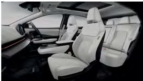
Option on EVOLVE and e-4ORCE EVOLVE: Grey - Synthetic Leather with Ultrasuede® inserts