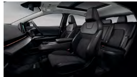
EVOLVE and e-4ORCE EVOLVE: Black - Synthetic Leather with Ultrasuede® inserts