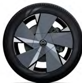
20" ALLOY WHEEL WITH AERO COVER (OPTIONAL ON ADVANCE, EVOLVE, E-4ORCE ADVANCE AND E-4ORCE EVOLVE)